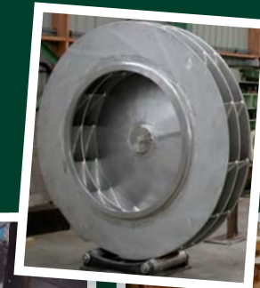
Repair and manufacture of fan runners.