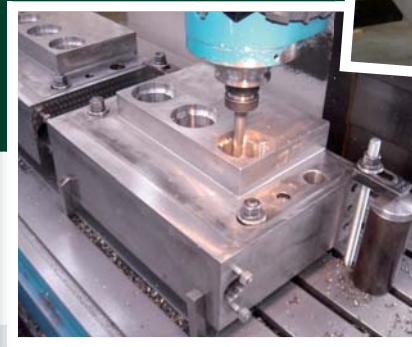
Gaulin Pump heads re-manufactured or made to order.