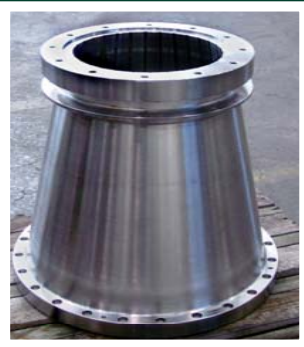
Decanter beaches made to order, longer wearing materials and alternative patterns.