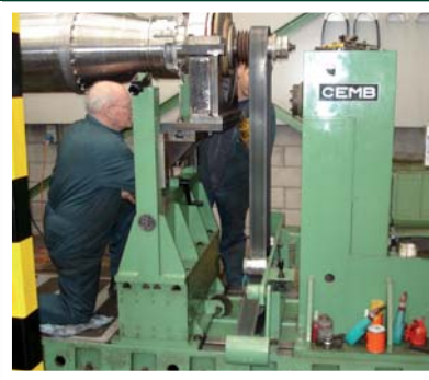
Dynamic balancing of decanter scrolls and assembled decanters.