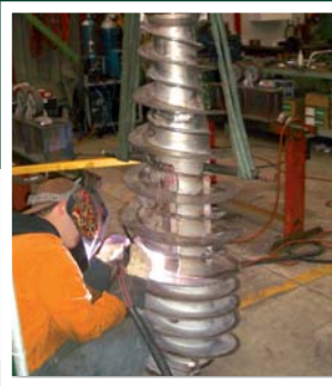
Repair or manufacture of full range of decanter components.